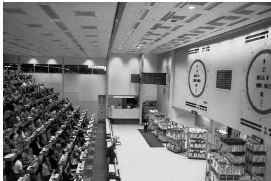
Dutch (Aalsmeer) flower auction